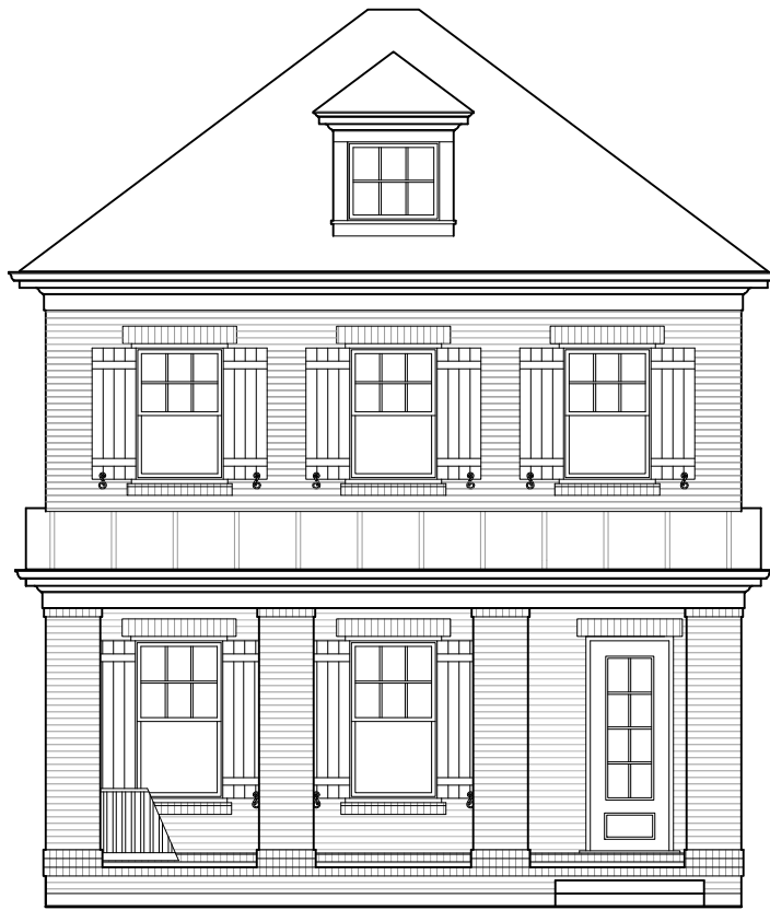
FRONT ELEVATION LOT B-024 - SPENCER